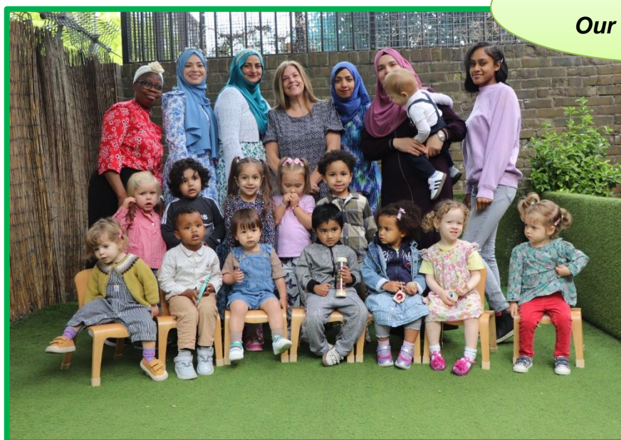
Our group picture